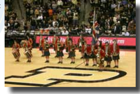
Purdue Halftime performance, December 31, 2011

In November of 2011, the band traveled to Fort Toulouse, an 18th century French outpost in Wetumpka, AL - near Montgomery. The band performed for three days, including a very large education day, where we presented to 4000 students who spent their day on the grounds.