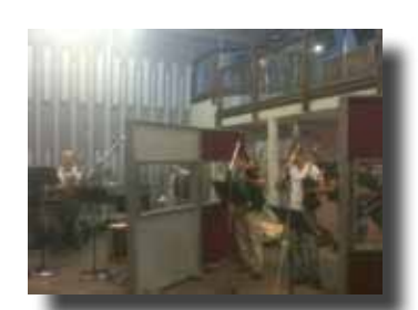
Plank Road Publishing Recording Session (Oct 2011)

As the St Patrick's Day season approached, the band was very busy around Indiana - beginning with a performance opening the March Lafayette, IN Hoot Night - a monthly local music feature held at the Lafayette Brewing Company. The band kicked off the evening, sharing a bill with 4 other local musical acts ranging from acoustic to hard rock. The St Patrick's Day season continued on March 16, when the band performed at the Indianapolis St Patrick's Day parade, joined our friends from Highland Reign playing a set in the parade's tent party, and finished the evening with pub performances all around downtown Indianapolis. The pub performances continued in Lafayette on the 17th - beginning with the annual parade at